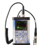
SVAN 974 Single-Channel Vibration Analyser