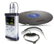
SV 106D Six-Channel Human Vibration Meter