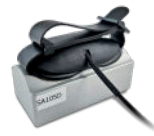
SA 105 Calibration Adapter to SV 105 and SV107 Accelerometers