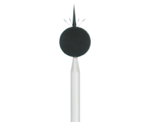
SA 279 Microphone Outdoor Protection Kit