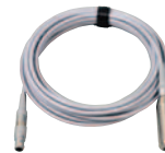
SC 93 Extension Cable for Preamplifier