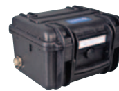
SM 279 PRO Outdoor Monitoring Case