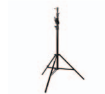
SA 420B Tripod Up To 4 m Height